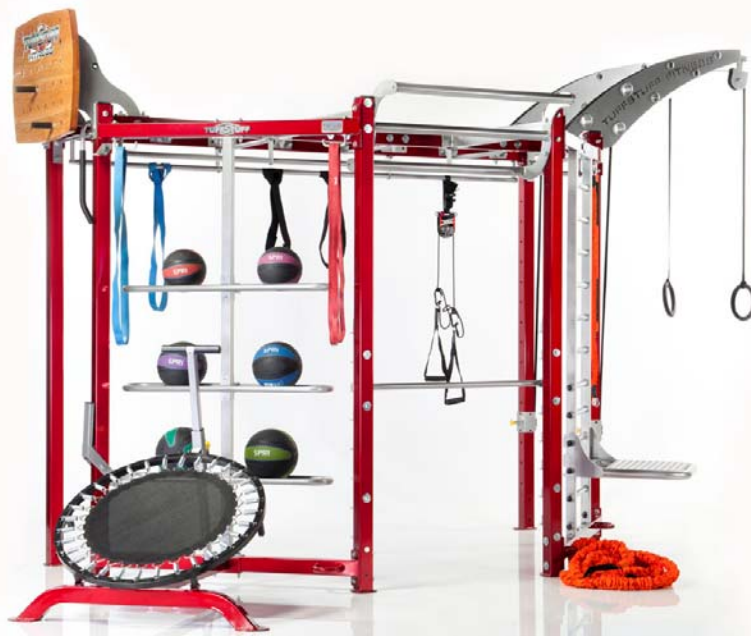
CT-8000B pictured in custom color: Lollipop Red/Platinum Sparkle. Accessories not included. Shown with CT-8210 and CT-8220 Training Modules.

NOTICE: TuffStuff continually engages in research related to product improvement. As a result, the product received by the customer may differ slightly from its published description. Improvements in materials, production techniques and design refinements may at any time be introduced into our products. TuffStuff reserves the right to make changes in its product without notice.