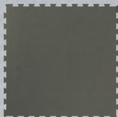
PAVIGYM STONE GREY.