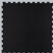
PAVIGYM JET BLACK

Special items on request: min. quantities of 70m2.