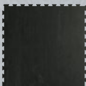
PAVIGYM B. MARBLE