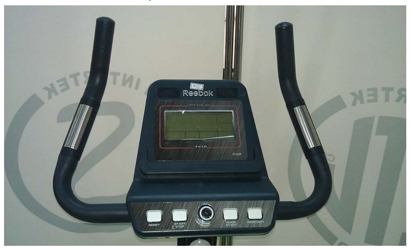
Power connection of RVTT-10101 Titanium TC1.0